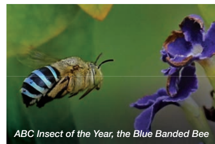
ABC Insect of the Year, the Blue Banded Bee