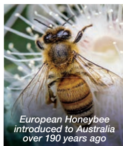
European Honeybee introduced to Australia over 190 years ago

So how can we individually help? Beaware of impacts, frugal application, and look at alternatives to the usage of insecticides. In your gardens and farms, value flowering plants, select a range of species that will flower at different times. I prefer the inclusion of a range of native plants, this will assist both European and Native Bees and a range of native fauna. I have several bee/bug hotels in my garden. These will provide homes and breeding sites. I have several insects including bees and wasps that pollinate our plants.